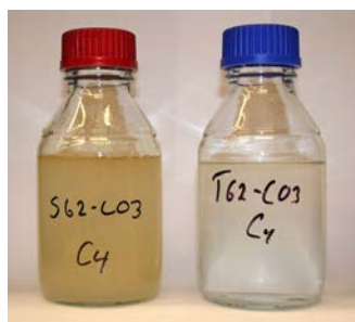
Figure 1: Example of water quality improvement between conventional valve (left) and Typhoon Valve System (right)

Linear inherent characteristics allow optimum control for liquid level systems and flow control processes.