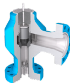
Figure 2: Low shear angle Typhoon System

For more detailed information, please contact Mokveld.