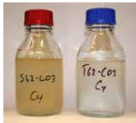
Figure 1: Example of water quality improvement between conventional valve (left) and Typhoon System (right)