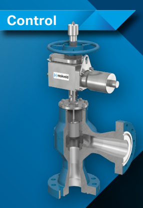
Angle choke valve Versatile heavy duty valves for severe applications