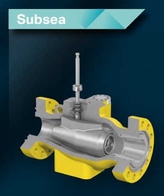
Subsea axial on-off valve (HIPPS) Severe duty on-off valve for quick-acting safety applications