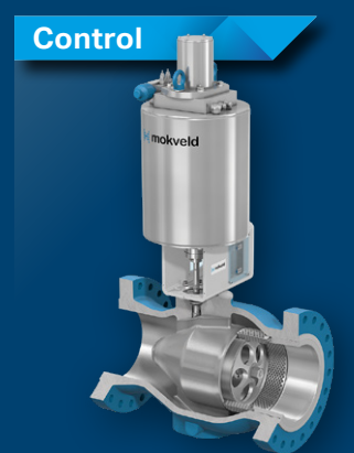
Axial control valve Streamlined flow path design for demanding applications

Mokveld provides the gas and oil industry with expert knowledge and highly advanced engineered valve systems for critical control and safety applications.