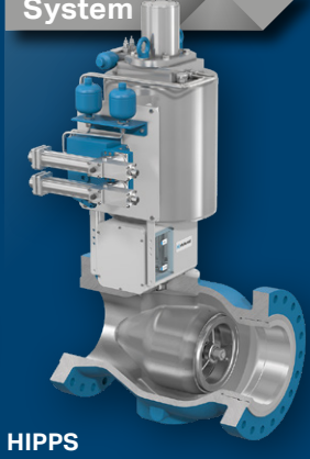
Mechanical or electronic High Integrity Pressure Protection System