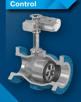
Axial choke valve Symmetrical flow path shaped for erosive applications