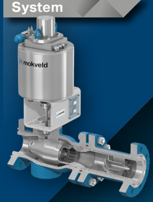
Axial Typhoon Valve System Low shear axial control technology for enhanced separation