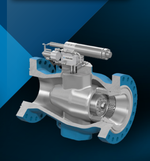
Axial surge relief valve Pilot activated surge protector for liquid applications