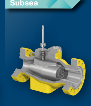
Subsea axial control valve For optimum control of subsea processes