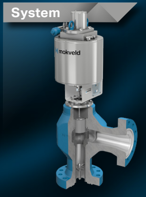
Angle Typhoon Valve System Low shear angle control technology for enhanced separation