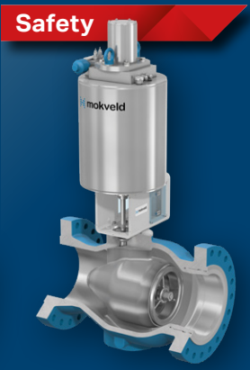
Axial on-off valve Balanced piston valve for special applications